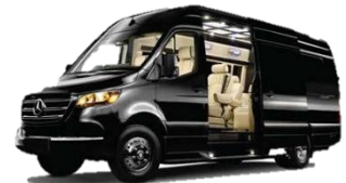
Sprinter 7+ People