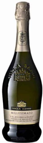
Villa Sandi PROSECCO DOCG BRUT 0,75 L, 2023 17 490 HUF / €45