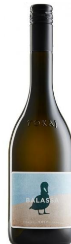
Balassa "KACSA" FURMINT 0,75 L, 2020 Tokaj 12 490 HUF / €32

15% service charge will be added to your final bill!