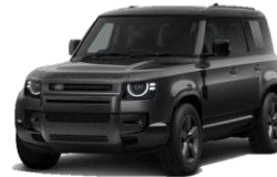
Range Rover SUV/ + Porsche Taycan