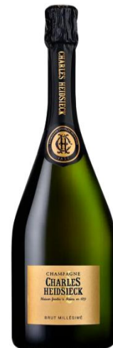
Charles Heidsieck BLANC DES MILLESIMÉ 0,75 L, 2014 269 990 HUF / €690

15% service charge will be added to your final bill!