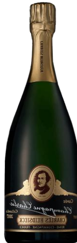
Charles Heidsieck CUVÉE "CHAMPAGNE CHARLIE" 0,75 L, NV 599 990 HUF / €1540