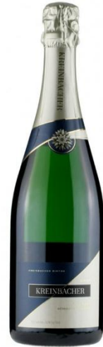
Kreinbacher BRUT CLASSIC 0,75 L, NV 19 490 HUF / €50