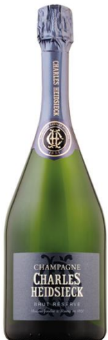
Charles Heidsieck BRUT RÉSERVE 0,75 L, NV 75 990 HUF / €195