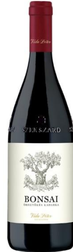
Vida Péter "PETIT BONSAI" KADARKA 0,75 L, 2023 Szekszárd 13 890 HUF / €35